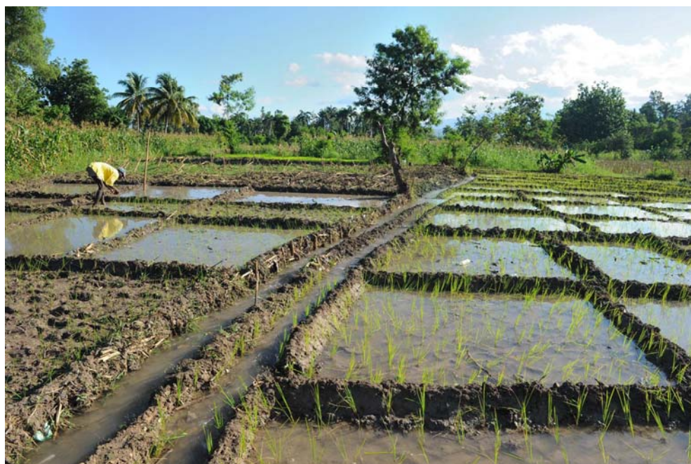
After the earthquake on 12 January 2010, a huge influx of displaced people moved to Haiti's 'rice basket', the Artibonite Valley. Some have managed to find work as day labourers on farms.

Even before the devastating January 2010 earthquake, Haiti was one of the poorest and most food-insecure countries on earth. A majority of Haitians live in rural areas and depend on agricultural livelihoods, but neither the government nor the international community has paid sufficient attention to agriculture, leaving the countryside increasingly marginalized. Trade liberalization has exposed farmers to competition from subsidized US rice exports and made consumers vulnerable to volatile global food prices. Agriculture must have a central place in post-earthquake reconstruction, with an emphasis on improving small-scale farmers' access to resources, so as to boost their incomes and productivity, particularly with regard to staple food crops. Urgent attention is also needed to reversing severe natural resource degradation. The Haitian government has devised a comprehensive agricultural reconstruction plan. It could be strengthened with additional attention to supporting the role of women in agriculture and food security, building the capacity of rural people's organizations, and decentralizing service provision. Donors need to quickly provide adequate resources to implement the plan, and should ensure greater coherence between their development assistance and trade policies. Increased attention to agriculture is vital to helping the Haitian people achieve their short- and long-term reconstruction goals.