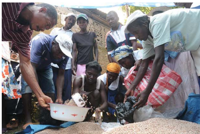
Seed distribution in Desvarieux.