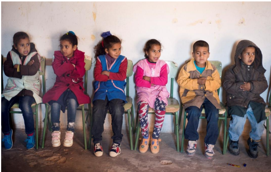
Children in a class for 7-8-year-olds in a primary school in Aousserd refugee camp.

Last September, the children in the refugee camps went back to school after the summer break– 32,028 returned to primary and middle school (up to the age of 16) 9 and 6,990 to nursery school. Literacy rates in the camps are remarkably high, but there are nevertheless a number of obstacles that get in the way of a high-quality education.