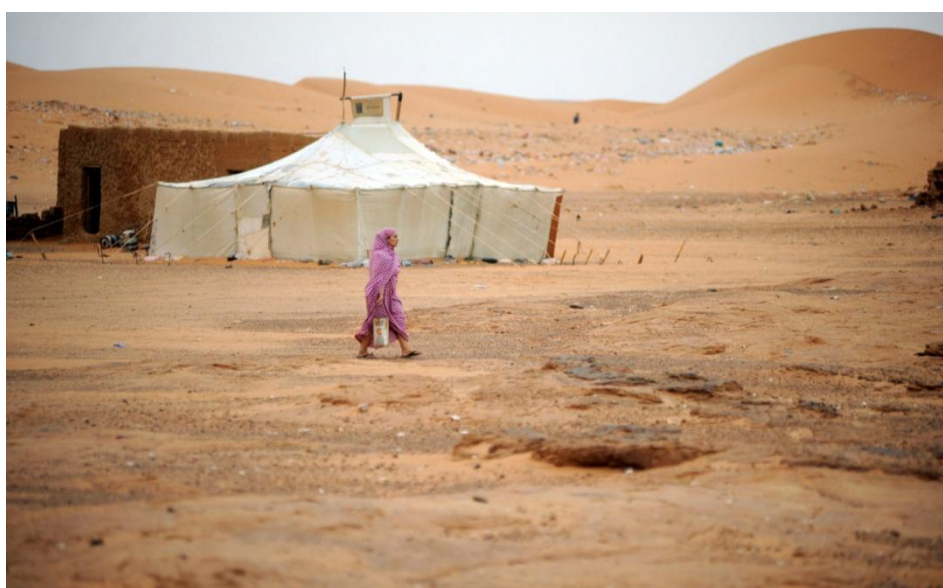
In Smara refugee camp, in southwest Algeria.

The arrival of these two nations claiming sovereignty over the Territory triggered an armed conflict with the Polisario Front, a liberation movement that the UN has considered the legitimate representative of the Sahrawi people since 1979. 1 This conflict marked the beginning of the refugee crisis.