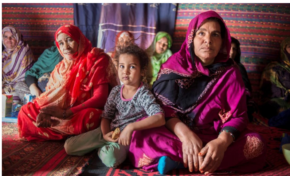
During an awareness-raising session on nutrition organized by the National Union of Sahrawi Women in Dakhla refugee camp.

In Sahrawi society, women traditionally play an important role in both the private and public spheres, a feature made evident by their role during the war for the Territory of Western Sahara – whilst men took part in armed combat, it was primarily women who established and organized the refugee camps. This historical factor has had direct repercussions on how public life is managed locally: today, all of the barrio leaders are women.