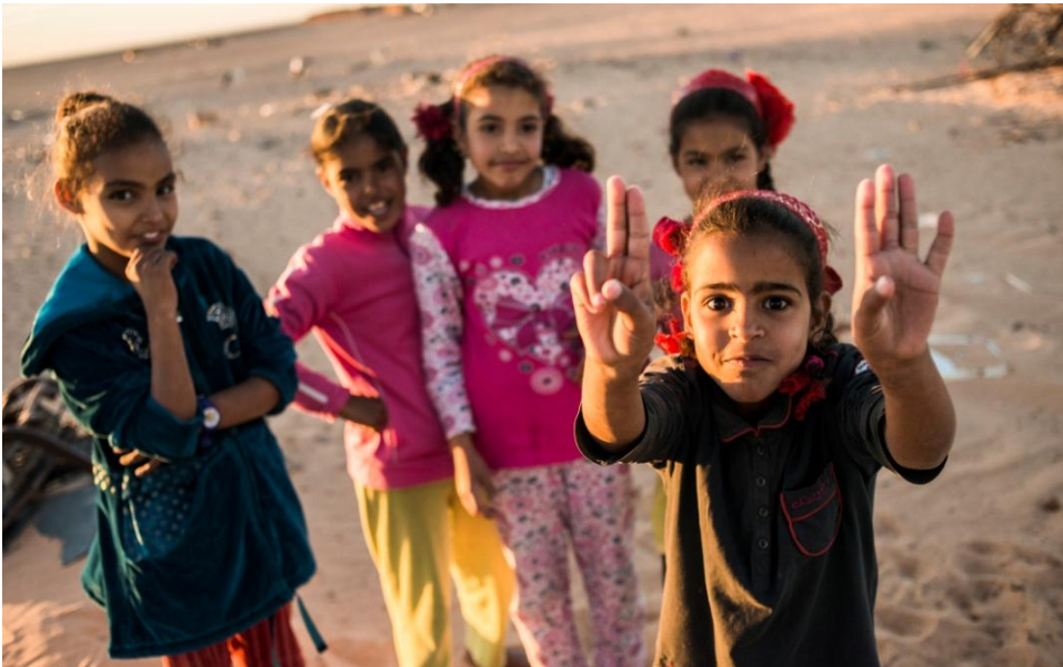
Children playing at sunset in Aousserd refugee camp, southwest Algeria

Neither the extreme humanitarian situation nor the growing frustration in the face of the status quo have succeeded in dispelling the refugees' ultimate hope of one day being able to return 'home'.