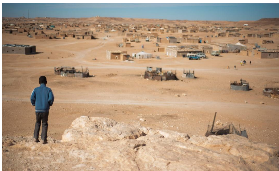
At a viewpoint above Laayoune refugee camp.

'With the holiday abroad programme and the increasing number of exchanges, young people see more and more of what goes on elsewhere, but the gulf between that and their own situation grows wider, which leads to a lack of understanding. Making comparisons with the outside world only causes pain and hurt. It's a world apart.'