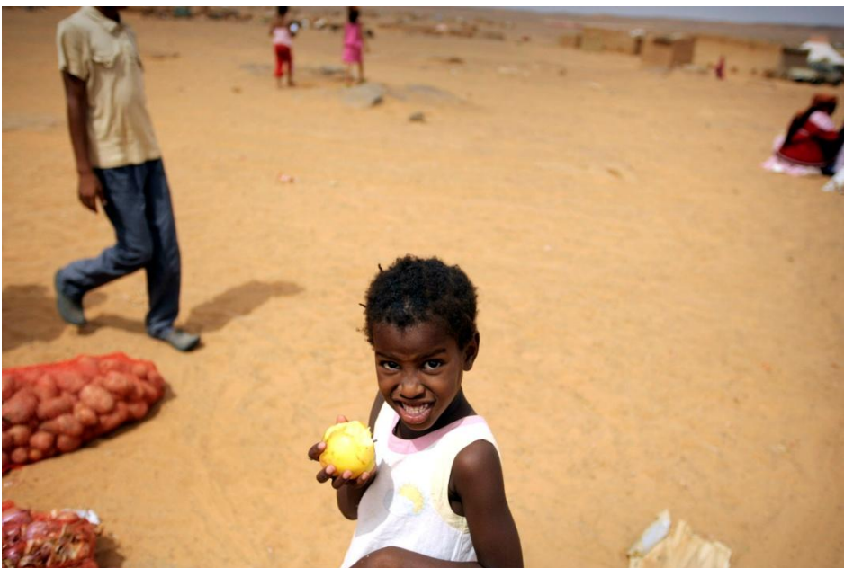
Oxfam distributes fresh produce (fruit and vegetables) in Smara refugee camp.

In the end, some essential nutritional requirements are still lacking. For example, monthly distributions of animal proteins – provided via supplies of tinned mackerel – were stopped in 2015 for economic reasons.