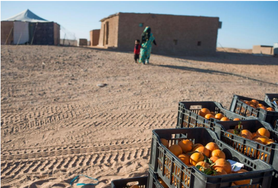
Oranges distributed by Oxfam in Boujdour refugee camp.

After a steady and continual decrease in funding over the last few years, 2015 presents a real challenge. Humanitarian workers have estimated the cost of humanitarian needs to be $37m, besides the basic food baskets distributed by the WFP. By November 2014, 75 percent of the needs identified – worth $28m – were not yet accounted for.