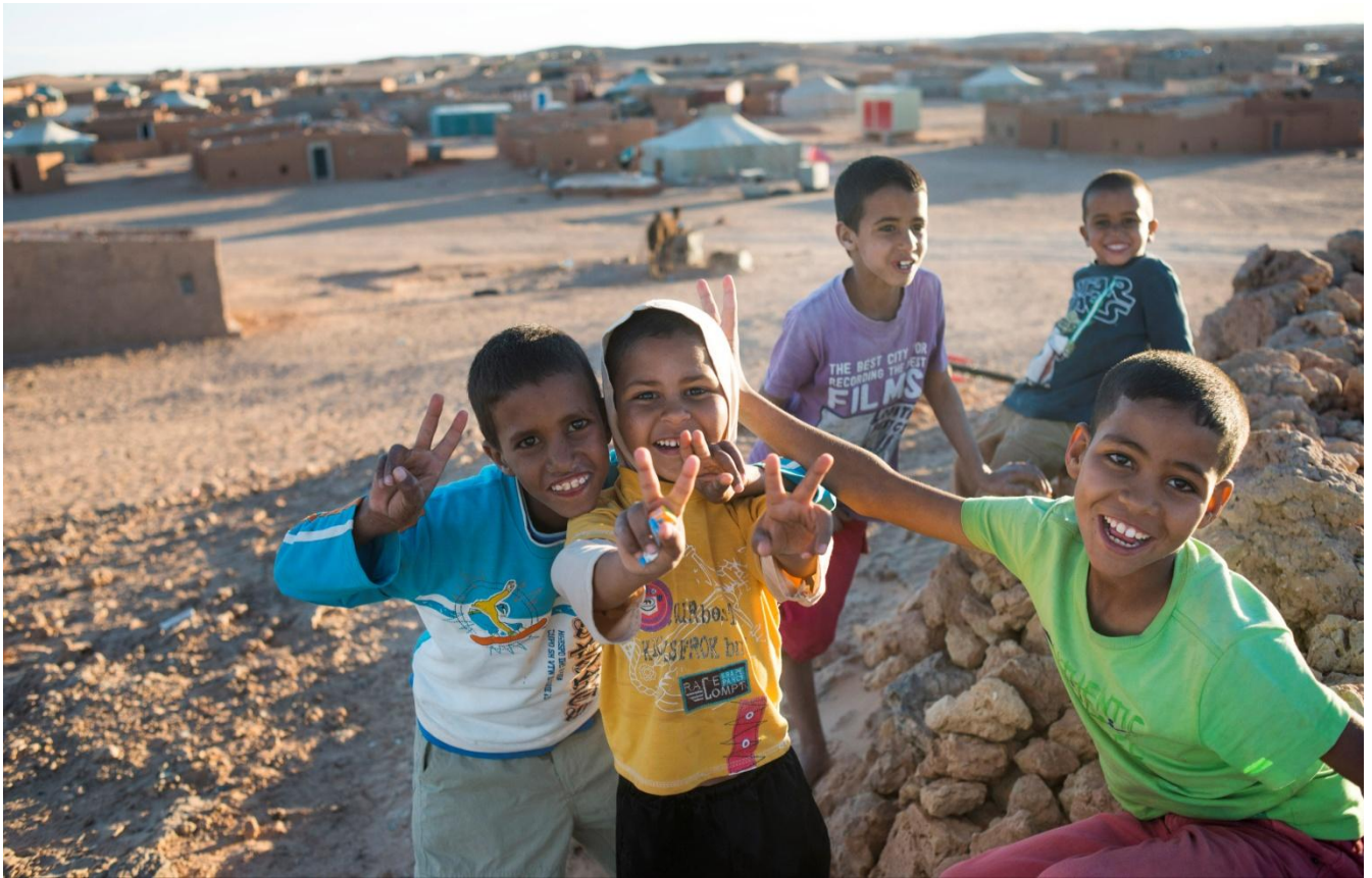
Children playing at sunset in Aousserd refugee camp, southwest Algeria.